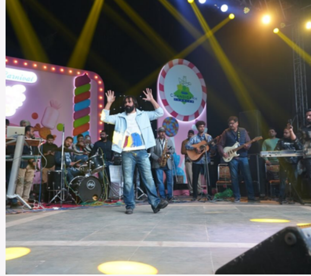
Previous Years Carnival Event Photos