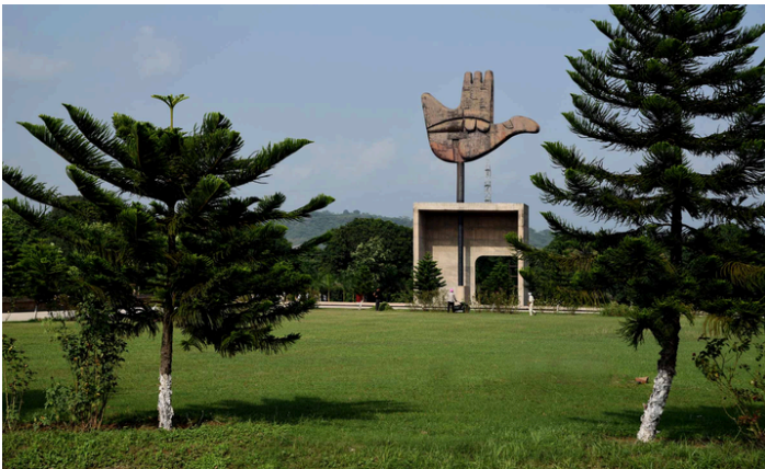
Open Hand Monument

Visit the Capitol Complex and explore these incredible architectural masterpieces that highlight the visionary work of Le Corbusier.