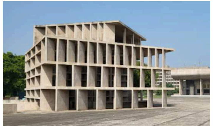
Tower of Shadows