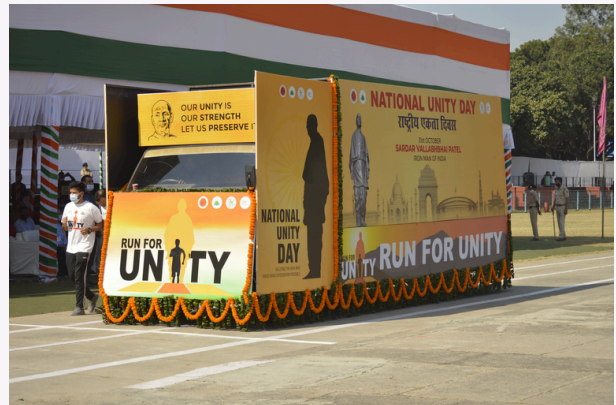
Previous Years National Unity Day Event Photos

National Unity Day, celebrated by the Department of Tourism, Chandigarh, every year, will honor the birth anniversary of Sardar Vallabhbhai Patel, India's first Deputy Prime Minister and Home Minister, on October 31, 2024. Known as the "Iron Man of India," Patel will be recognized for his pivotal role in unifying the country post-independence. The Department of Tourism will organize a run to commemorate his legacy. The day will aim to promote national integrity, foster unity among citizens, and remind people of Patel's contributions to India's political and social fabric. The celebrations will reflect Chandigarh's commitment to preserving the spirit of unity and patriotism.