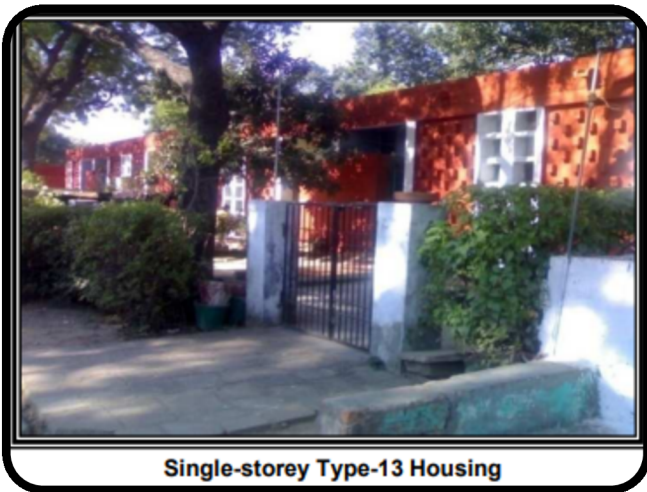
Single-storey Type-13 Housing